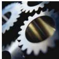
STI's software tools and services make your organization's application software work as one.

Semper Technology, Inc., (STI) provides cutting edge software tools and services to Raiser's Edge (RE) users. Our Xtend™ software tools allow us to rapidly and cost-